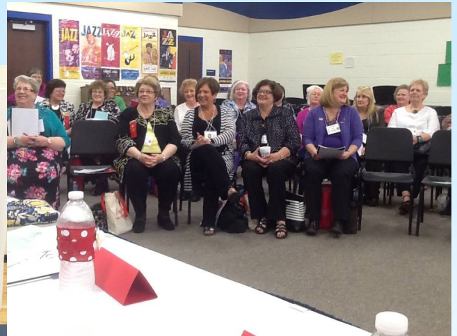
NU and THETA ready for Business Meeting (above)