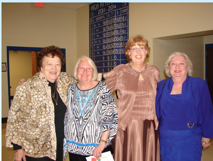
GAMMA Chapter raising funds for Scholarships