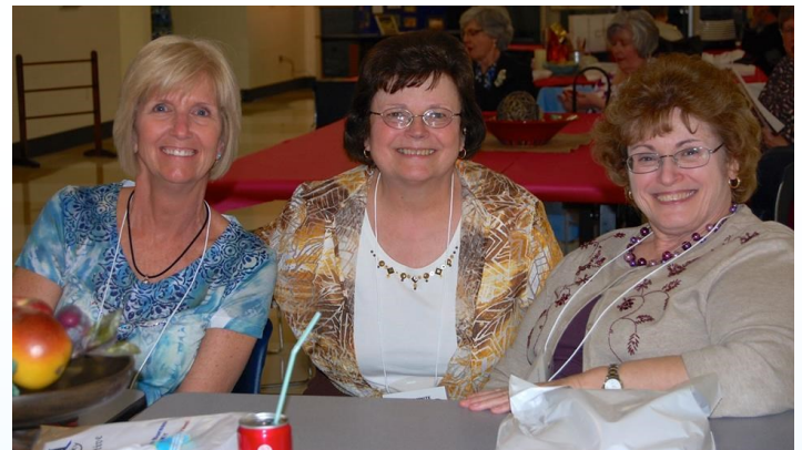
Supporting Paducah's Empty Bowls Project on Friday Night