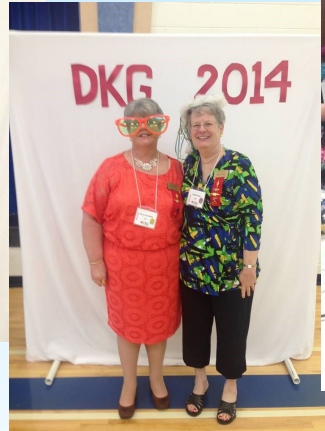
Having Fun at the Photo Booth